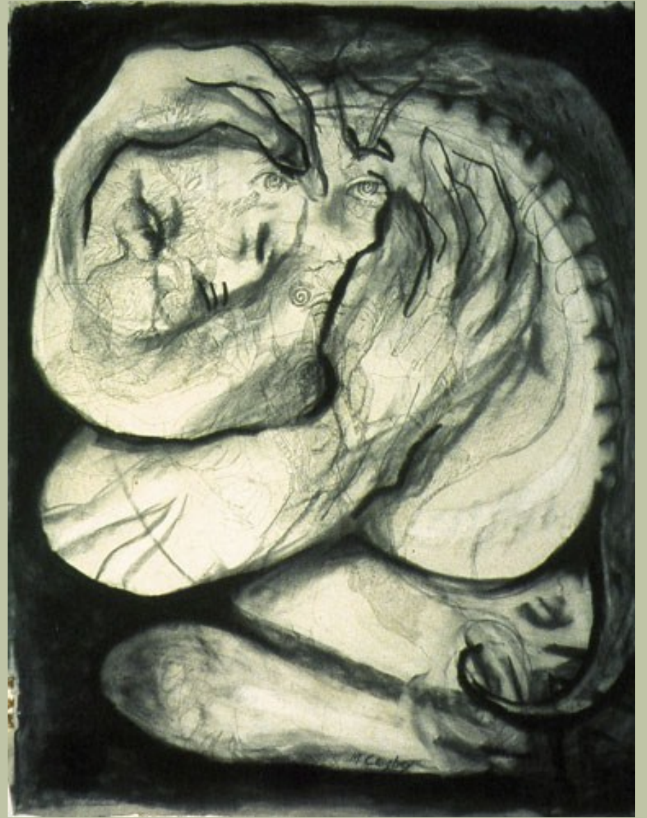
Meghan Caughey - "Hugging Form"