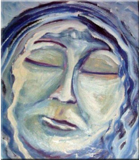
Artist: Ken Segal, DE - “Sorrow 2”

When trauma becomes disabling it impacts your feelings, your thoughts, and your ability to manage your life. It can especially affect how you deal with stressful events.